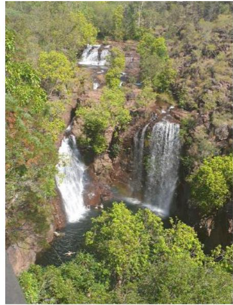
The beautiful Florence Falls in the Litchfield Park