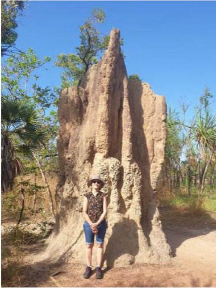
A tall termite mound that is 50 years old!