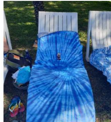
Chris' crow bear relaxing by the pool after a swim in the warm, sunny weather!