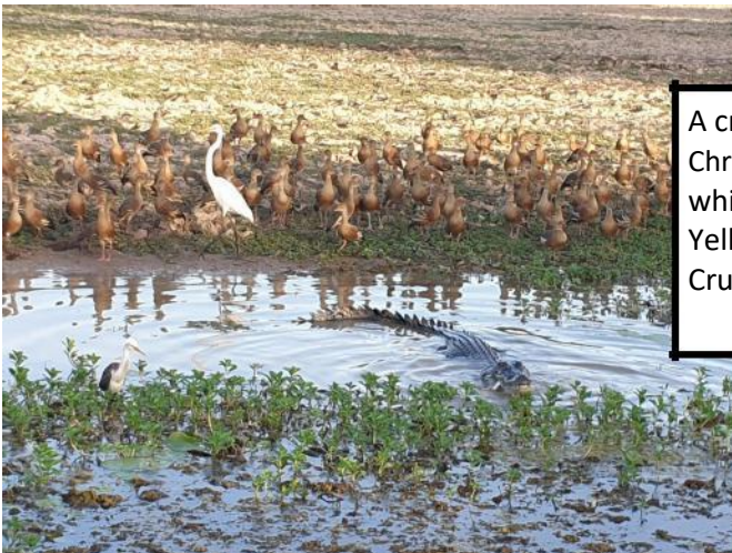
A crocodile Chris spotted while on the Yellow River Cruise!